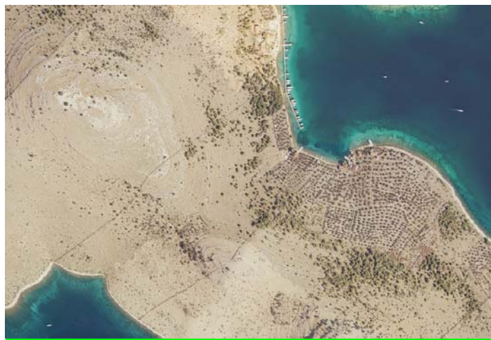
Figure 1: DOP5 section

Although the SGA has systematically produced DOP5 since 2001, DOP5 are produced for the first time in the new system (6,859 sheets) as part of the LPIS Project. The DOP production is based on the new aerial photogrammetric survey (determining the projection central coordinates for each photography by using the GPS/IMU system), determination of orientation points (reduced number of points determined by using the CROPOS system of the SGA), leveling the aerial triangulation blocks, and supplementing and producing the new digital terrain model (Lemaić et al., 2009). The DOP's are being produced in color with the resolution of 0.5 m. Under earlier contracts, the DOP5 was produced on the basis of cyclic aerial photography in the scale of 1:20,000 shot by analogue cameras and, more recently, by digital cameras. The primary service aim in the production of digital orthophoto maps in the scale of 1:5,000 is to develop a multi-purpose spatial information system that will serve as the basis for the broader National Spatial Data Infrastructure (NSDI) for Croatia. A section of the DOP5 is shown in Figure 1.