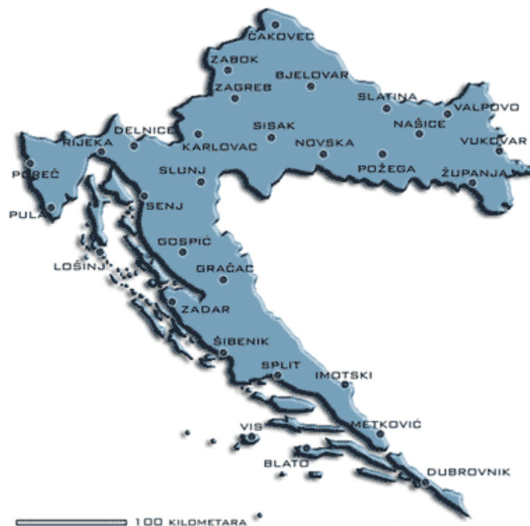
Figure 5: CROPOS network (URL5)

CROPOS is a network of 30 reference GNSS stations, available to its users 24/7. The reference stations are 70 km apart and are distributed in such a way as to cover the entire Croatian territory for the purpose of collecting the data of satellite measurements and calculating the correction parameters. The purpose of the CROPOS system is to enable the point determination in real time with the horizontal accuracy of 2 cm and the vertical accuracy of 4 cm in the entire country. The correction parameters are available to the users in the field via wireless Internet -GPRS/GSM (URL5).