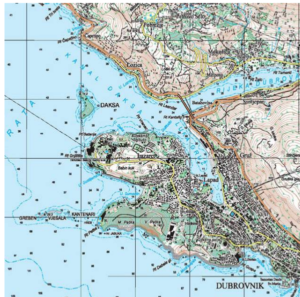
Figure 3: TM25 section

The basic original for the topographic survey in the Republic of Croatia is the aerial photography in the approximate scale of 1:20,000. The photographs produced by aerial photography are subjected to aerial triangulation followed by the restitution performed by analogue and digital stereo instruments. The mapping is defined by the RoC Topographic Information System – CROTIS data model. Since 1996, all 594 sheets of TM25 have been reproduced for the entire RoC territory. A section of the TM25 is shown in Figure 3.